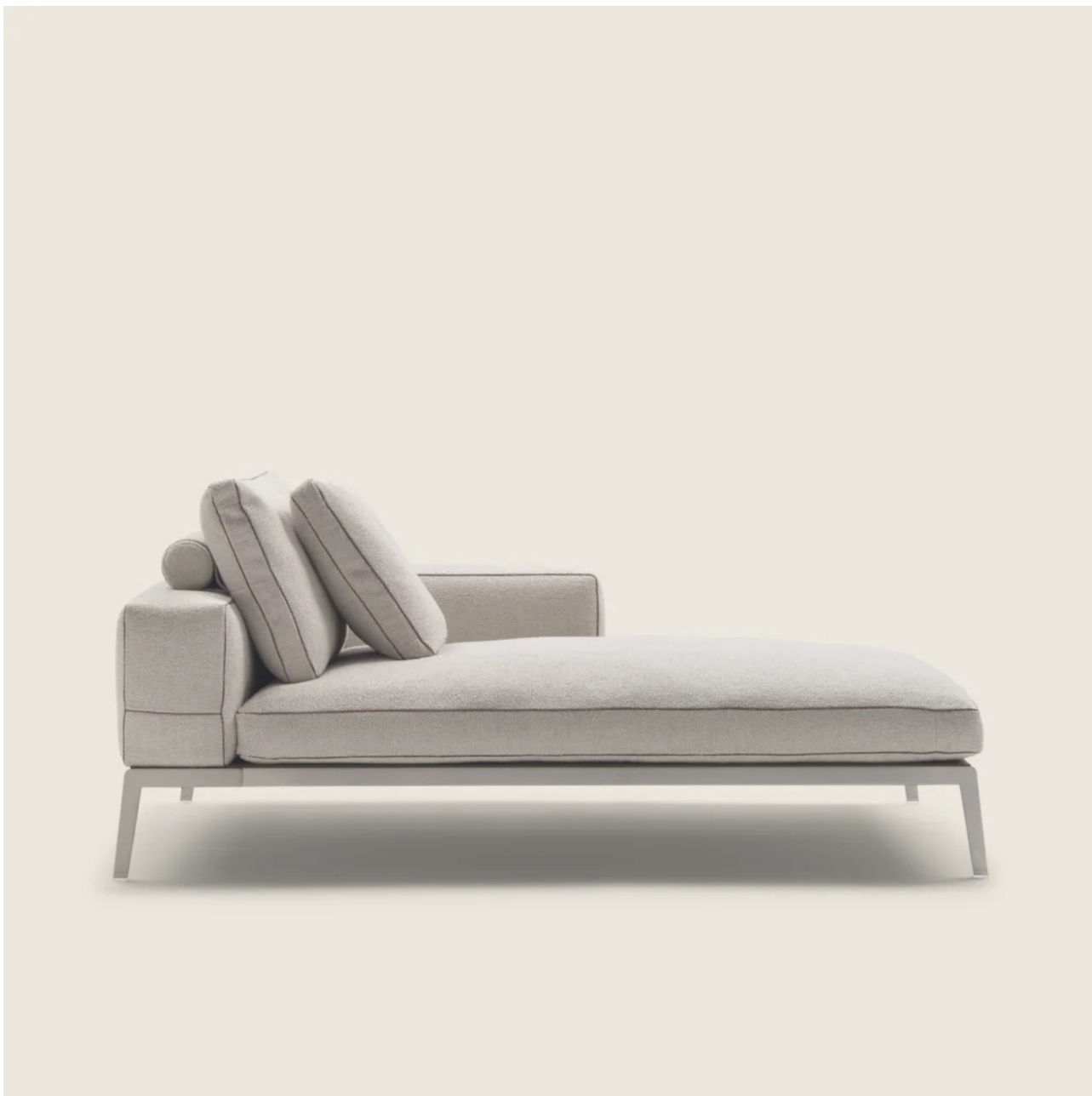
LIFESTEEL ANTONIO CITTERIO 2006 CHAISE LONGUE/DORMEUSE